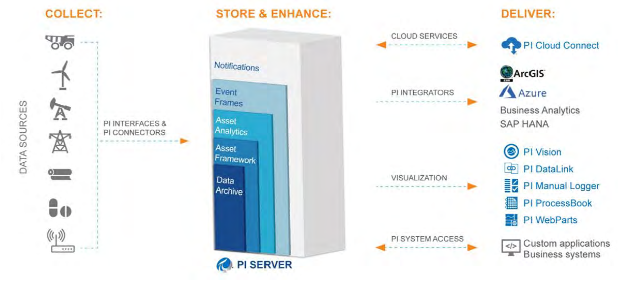
Figure 2-1. OSIsoft's PI System Modules and Processes

OSIsoft developed the PI System in the early 1980s to enhance industrial data management tools. The PI System initially functioned as a data historian—a database for equipment. Over time it has evolved into a data infrastructure for diagnostics and decision-making to reduce costs, increase output from fixed capital, and improve safety, among other capabilities. Today, companies like Canadian oil producer Syncrude and Duke Energy have reported saving millions of dollars using the PI System for condition-based maintenance. OSIsoft also has technologies like Asset Framework (for digital twins), Event Frames (for batch or excursion summaries and notification), and PI Vision (visualization), as shown in Figure 2-1.