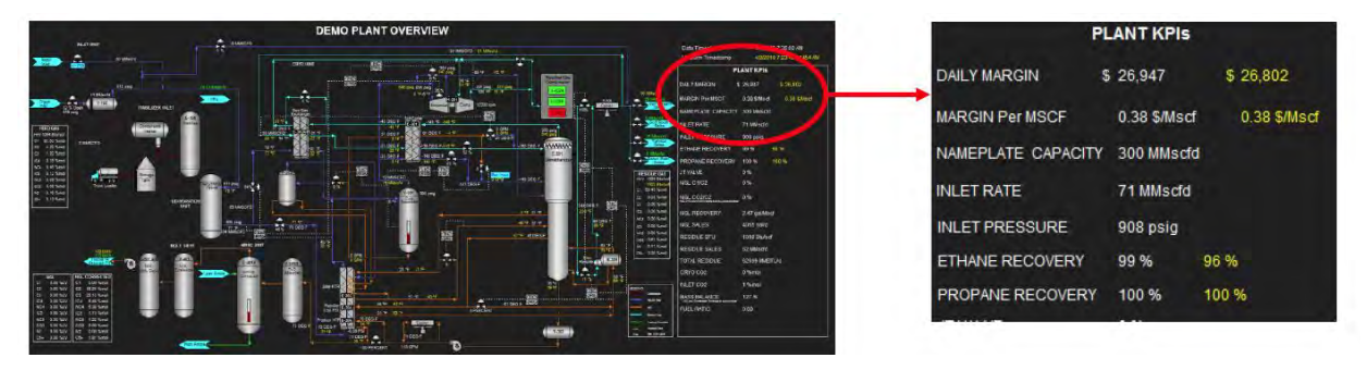
Figure 2-3. DCP Midstream's Daily Margin Data Output Using the PI System

Having timely data about the price of ethane, contract details, and plant operations is important in a dynamic market like gas processing. Depending on the variables, a manager needs to make critical decisions quickly, and this cannot be done on spreadsheets or in one's head. Also, the company must prove it operates within environmental standards and that requires data collection and reporting. Previously, that was done manually, but the PI System has automated that process as well.